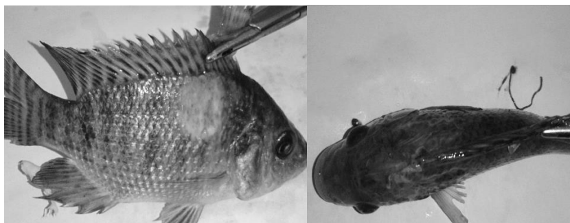
Figure (1): O. niloticus showed white necrotic tissue, rough scales and scale less area behind the head.