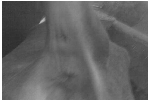
Photo 1: Post vaccinal reaction in calves vaccinated with Romanian sheep pox vaccine.

TCID 50 = Tissue culture infective dose 50.